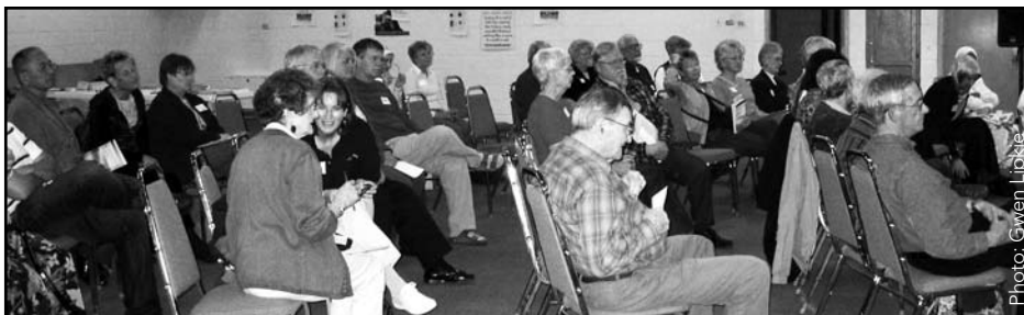
Participants in one of last year’s interfaith dialogues listen to a panel presentation.

With this in mind, the Interfaith Commission of TIA-CO will be offering three evenings of facilitated dialogue this year, beginning Thursday, May 15. Future dates and locations will be announced through the newsletter, website, and monthly electronic newsletter, so stay tuned.