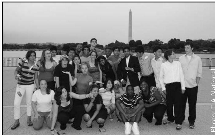
Participants in the 2007 LEADD camp pose for a photograph near the Washington Monument in Washington, D.C.